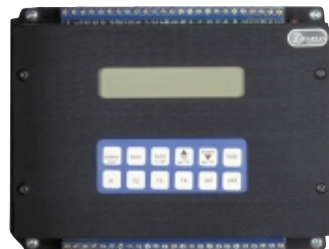
Trifecta Control Center

* Models accepting other input power available